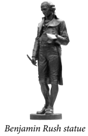
Benjamin Rush statue

RESERVED SEATING Guests of the Platform party