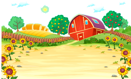
This Photo by Unknown Author is

Something that the Blue Bears have been working on as a whole group is keeping our hands and feet to ourselves. We have been working on staying in our own "bubbles" and staying out of our friend's "bubbles." Talk with your child at home about what personal space means and remind them about asking for hugs from friends and that it's even okay to tell someone they don't want a hug if asked!