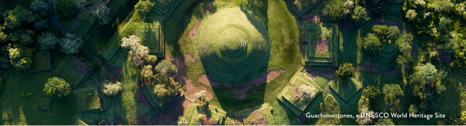
Guachimontones, a UNESCO World Heritage Site