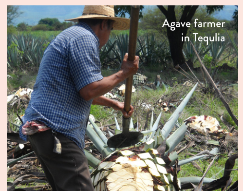
Agave farmer in Tequila