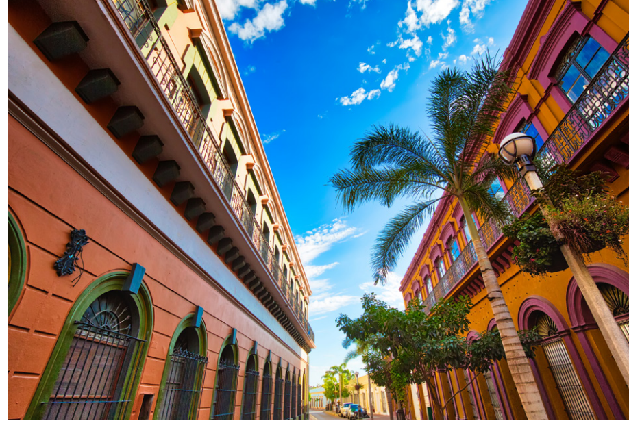
CLOCKWISE FROM TOP LEFT: Guadalajara Colorful buildings in Mazatlán Beaches of Mazatlán Tequila cocktail

time. Mezcal producers from Tequila helped establish the predominant international standard for agave spirits. We'll learn about the Tequila distillation process at the world-famous Jose Cuervo distillery and taste some of their premium tequilas. HOTEL SOLAR DE LAS ANIMAS (B,L,D)