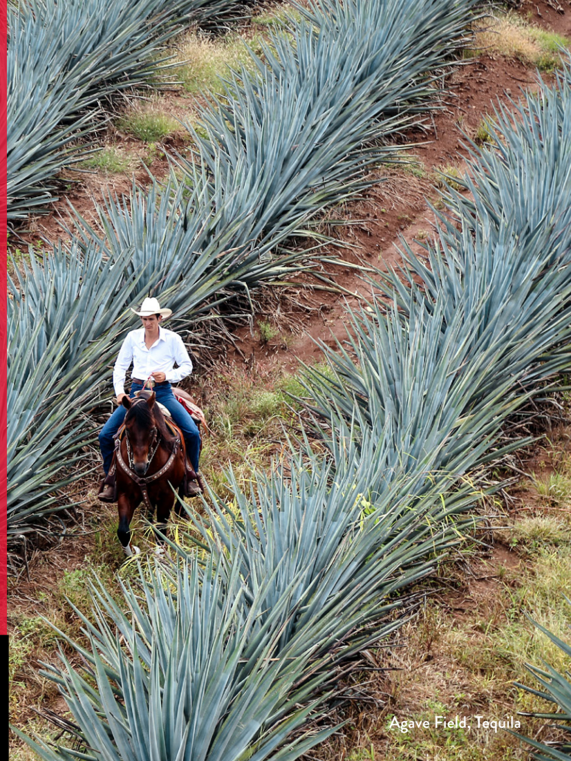
Agave Field, Tequila