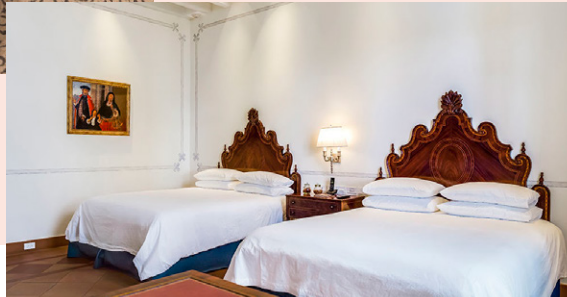
CLOCKWISE FROM TOP LEFT: Queen room, Quinta Real; Courtyard seating area at Hotel Solar de las Animas; Superior Double room at Hotel Solar de las Animas; Exterior of Quinta Real.