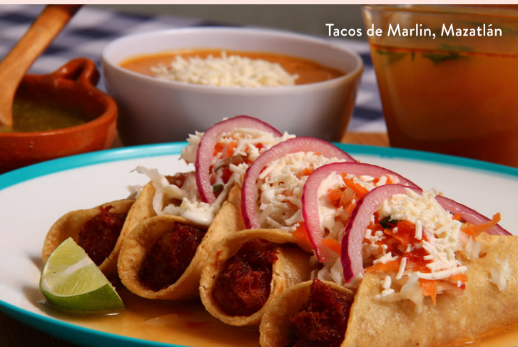
Tacos de Marlin, Mazatlán

This tour is designed for Dickinson College alumni, family, and friends who are interested in learning and experiencing a total solar eclipse as well as the culture, history, cuisine, and flora of western Mexico. This tour is a shared departure with the Alumni Association of the University of Michigan. The pace of walks will be leisurely occasionally over unpaved or uneven surfaces. Average temperatures in Guadalajara in April are between 89° and 52° F; Tequila 76° to 53° F; and Mazatlán 83° to 63° F. Since some travel will be in remote areas, everyone must be flexible concerning time schedules, weather, and dust. To