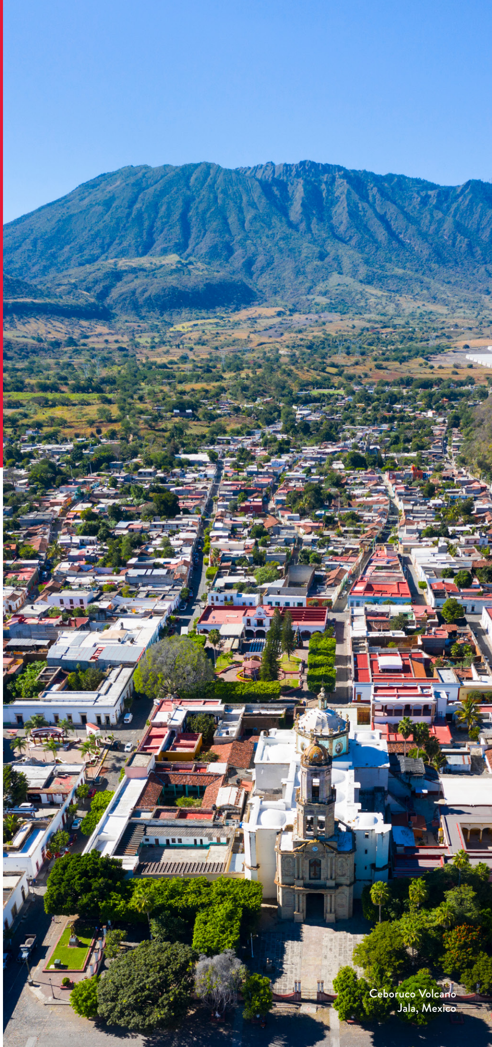
Ceboruco Volcano Jala, Mexico

CELEBRATE the total solar eclipse at a farewell dinner in Mazatlán's old downtown with its colorful and renovated French-inspired buildings