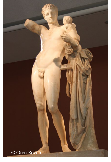
Above, Praxiteles' Hermes and the Infant Dionysus, on display at the Olympia Museum; (below) a shallow bowl (kylix) with an unusual depiction of the god Apollo, found in a grave underneath the Delphi Archaeological Museum, where it is currently displayed

The morning may begin with a return visit to the Olympia site museum, if we did not have a thorough visit the previous day. Then we take a beautiful drive (approx. 3.5 hrs.) crossing the Gulf of Corinth via the Rio-Antirrio