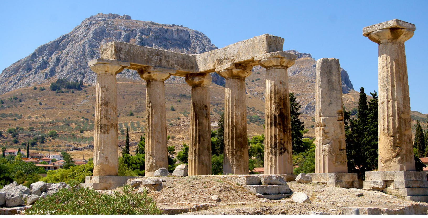
Temple of Apollo, Corinth

bridge, one of the world's longest multi-span, cable-stayed bridges. Arrive at the mountain resort town Arachova, at the foot of Mount Parnassus, where we check-in to our hotel and have some time this afternoon to settle in before we gather this evening for dinner. Overnight at the 4-star <u>Aegli Arachova</u> for two nights. (B,L,D)