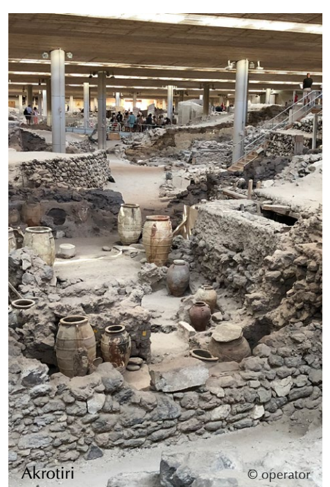
© Copyright 2021 Eos Study Tours. All rights reserved.