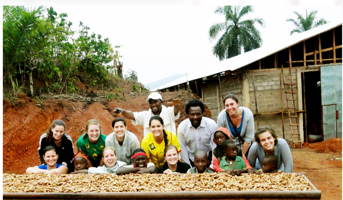
Dickinson Students in Cameroon at Utamtsi co-operative

http://www.dickinson.edu/academics/distinctive-oportunities/community-studies-center/home-page