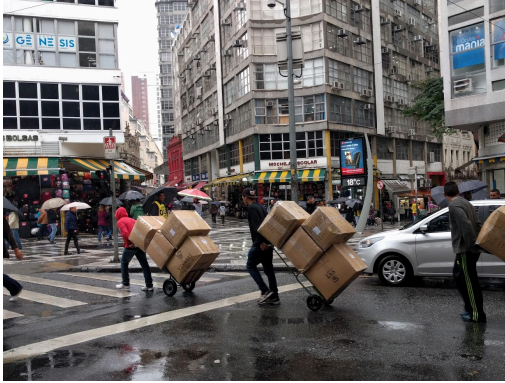
Downtown São Paulo