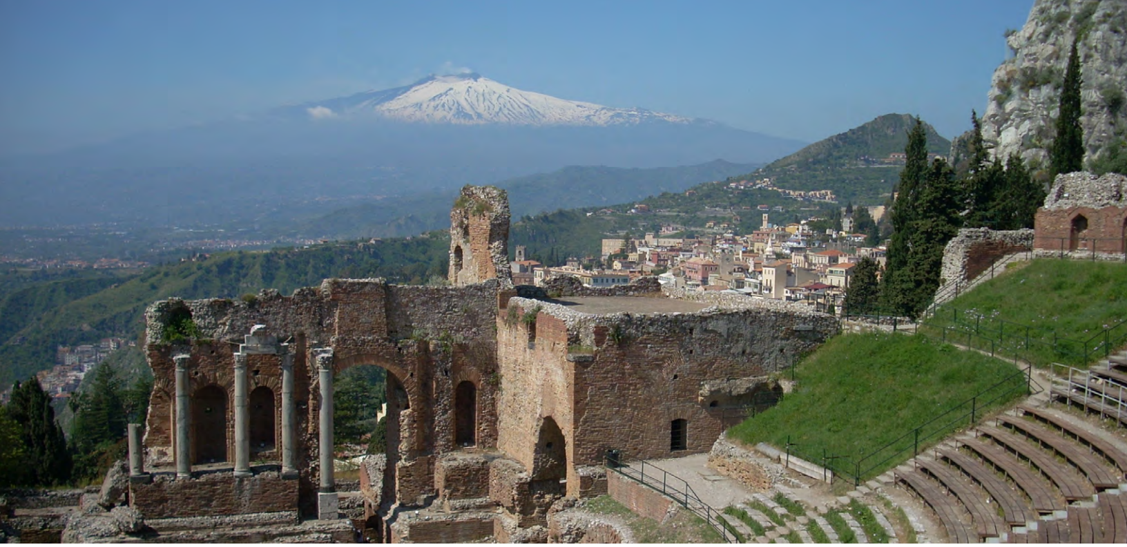
Visit this ancient Greek theater in Taormina with a view of Mt. Etna.

15 minutes, with lava flow that runs down into the sea. Enjoy a full-day excursion here, including a picnic lunch. On our way back to Panarea, stop at one of the smallest rock formations to see underwater vapor spouts and swim in hot waters, weather permitting. (B,L,D)