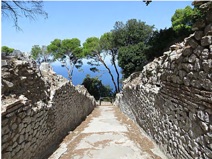
Villa Jovis, one of twelve ancient Roman villas on the island of Capri.