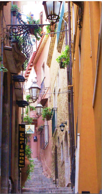
A charming side street in Taormina.

Travel to Europe’s largest active volcano, Mt. Etna, a UNESCO World Heritage (natural) site that dominates eastern Sicily. Rifugio Sapienza (at 6,000 feet) is the starting point of our walk today.