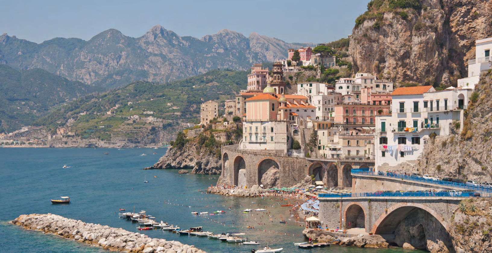
On the Amalfi Coast, you have time to explore the city before venturing into the mountains for a hike.