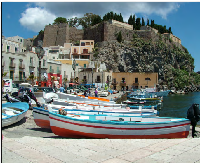
Lipari, one of the seven Aeolian Islands off the coast of Sicily.