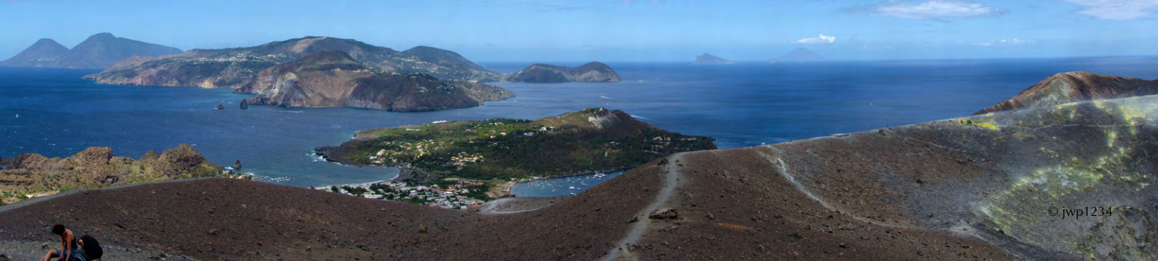
A view from Vulcano, another of the seven Aeolian Islands.

discover Amalfi's Duomo and take some time to explore the charming town at your own pace. After an independent lunch, depart to Agerola from where we hike the breathtaking "path of the Gods" to Positano, a journey back in time to the glories of ancient Greece. Return to Naples and enjoy a special dinner of local family dishes at a private palace in Posillipo, hosted by the owners. Weather-permitting, we will dine on the terrace, with views of the island of Capri and Mt. Vesuvius. (B,D)