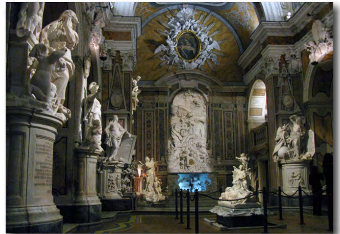
Sansevero Chapel, located in downtown Naples.

(B)= Breakfast, (L)= Lunch, (R)=Reception, (D)= Dinner