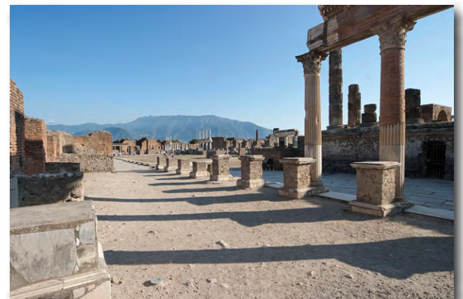
Pompeii, the archaeological site preserved by the eruption of Mount Vesuvius.