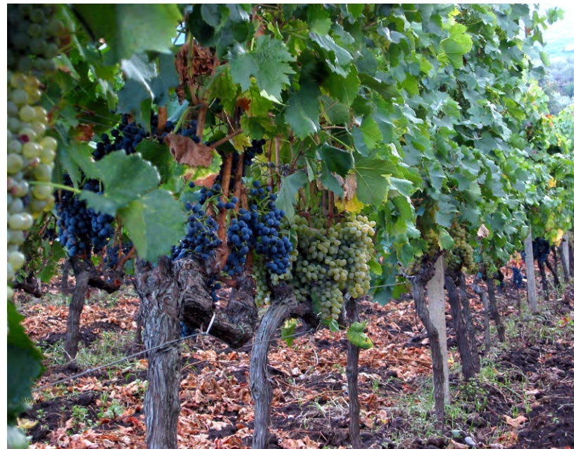
Visit a more than 400-year-old winery on the slopes of Mount Etna, Sicily.

Transfer this morning to Catania-Fontanarossa Airport (CTA) for flights homeward. (B)