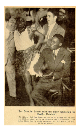
Figure 1. Caption: "The Jew in his element: With Blacks in a Parisian night club.

Der Ewige Jude, Munich: Zentralverlag der NSDAP., Franz Eher, Nachf., 1937.