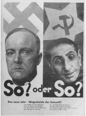
Figure 2. This image portrays a warning of eastern European "subhumans"

"Das neue Spiel: S.A. räumt Liebknechthaus," Illustrierter Beobachter , 15 April 1933.