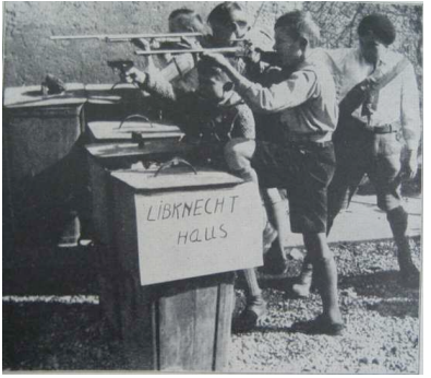
Figure 3. Caption: "The Liebnecht House's last defenders"

Der Ewige Jude, Munich: Zentralverlag der NSDAP., Franz Eher, Nachf., 1937.