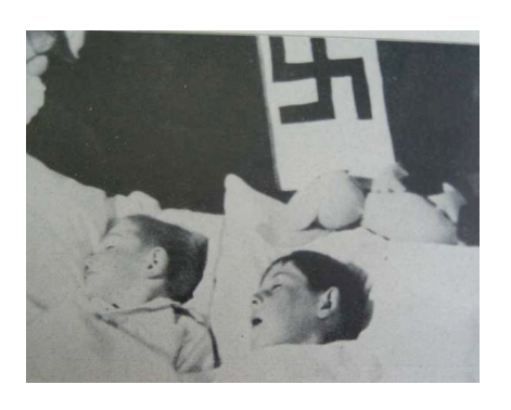
Figure 5. Caption: "One is weary after hard political labors."

Der Ewige Jude, Munich: Zentralverlag der NSDAP., Franz Eher, Nachf., 1937.