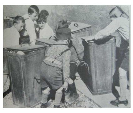
Figure 4. Caption: "The Liebnecht House is captured."

"Das neue Spiel: S.A. räumt Liebknechthaus," Illustrierter Beobachter , 15 April 1933.