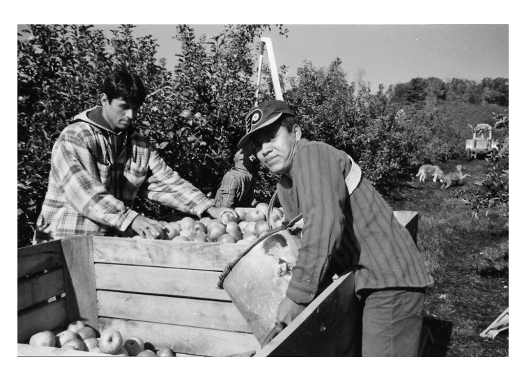
Apple pickers and bins in Adams County.

Some former Mexican migrant workers have decided to settle in the small towns that dot the county, particularly in municipalities such as Biglersville, York Springs, and Gettysburg. They, in turn, support other family members who come to work in area factories and restaurants. These more permanent residents are in the process of establishing a transnational Mexican community in Adams County, a development that has introduced the region to new degrees of linguistic, racial, religious, and cultural diversity. For this reason, the region provides a rich site for students interested in learning about ethnicity and multiculturalism in the U.S.