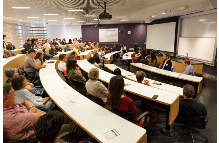
Stafford Auditorium, Rector, Dickinson College