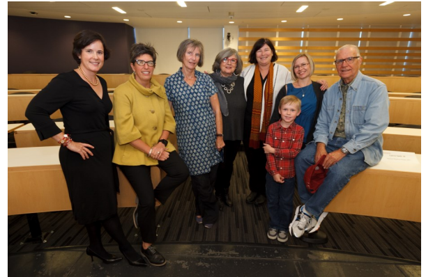
Steelton Mosaic 20 Years Later +1