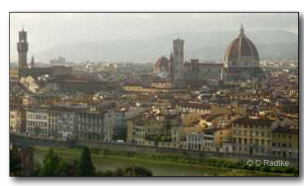
Admire the splendid architecture of Florence (above) and Pisa (bottom). View Renaissance sculptures and paintings such as Botticelli's masterpiece Primavera (below).