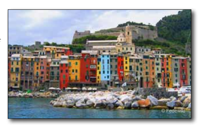
Enjoy a short boat ride across the famous Gulf of Poets to the charming village of Portovenere (above). Admire medieval castles in the rugged Apennine Mountain region (below).

After breakfast, there is a group transfer to Florence airport for flights homeward. (B)