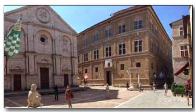
Stroll through delightful Tuscan town squares such as Pienza Piazza (above). Many Tuscan towns were founded by Romans and even earlier by Etruscans, such as the ancient town of Volterra (below).