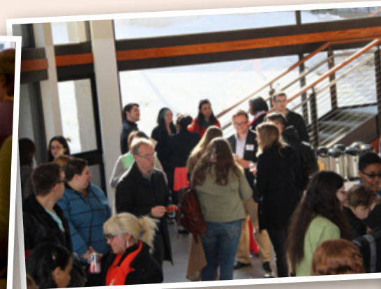
GSA Leadership Summit 2014