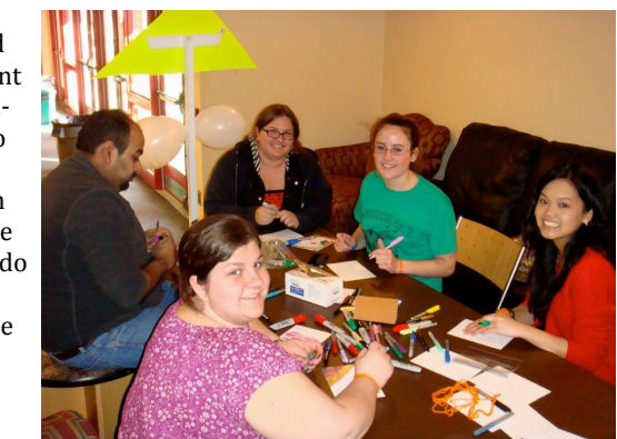
Writing cards for soldiers at the Charity Fair.

Shoot for Good was an idea started by an alumnus of Dickinson to encourage others to take pictures of the good they saw in their community. The photos were meant to inspire others to act in ways that positively affect their community after seeing others doing the same. I decided this may be a fun idea to take back to Dickinson.