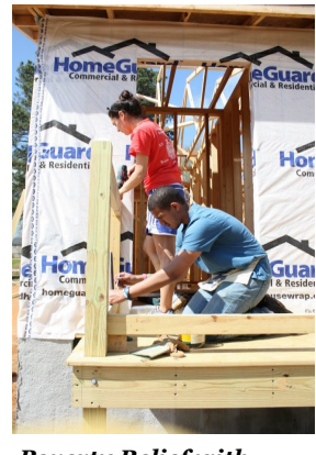
Poverty Relief with Habitat for Humanity

stand the global and historical context in which these communities exist. That makes us all better equipped to engage the world beyond Dickinson.