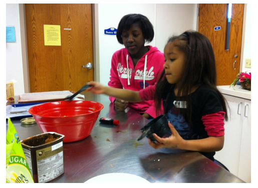
Kids making a snack with the Healthy Eating at Empower!