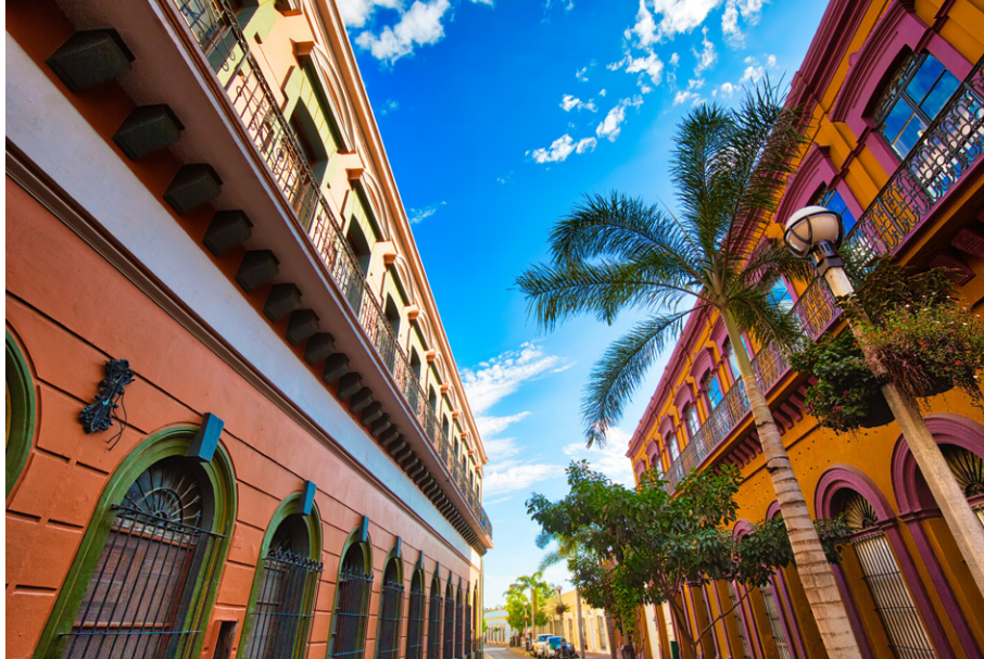
CLOCKWISE FROM TOP LEFT: Guadalajara Colorful buildings in Mazatlán Beaches of Mazatlán Tequila cocktail

time. Mezcal producers from Tequila helped establish the predominant international standard for agave spirits. We'll learn about the Tequila distillation process at the world-famous Jose Cuervo distillery and taste some of their premium tequilas. HOTEL SOLAR DE LAS ANIMAS (B,L,D)