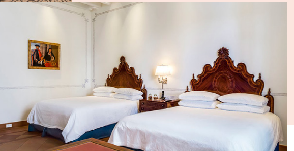
Queen room, Quinta Real; Courtyard seating area at Hotel Solar de las Animas; Superior Double room at Hotel Solar de las Animas; Exterior of Quinta Real.