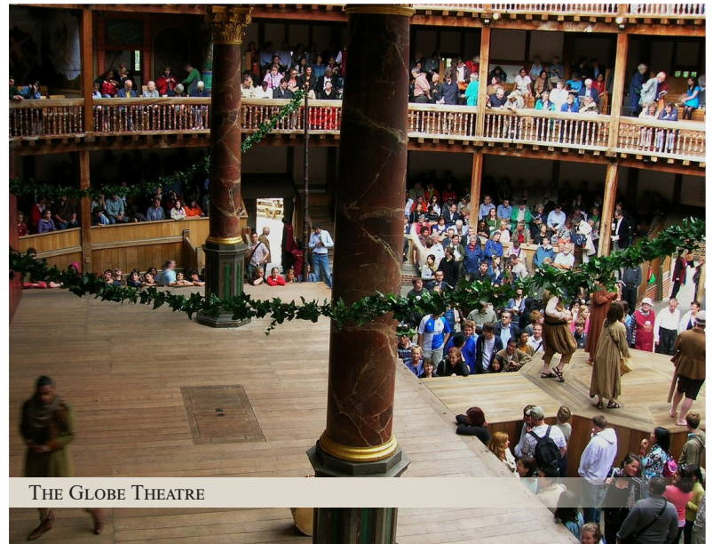
THE GLOBE THEATRE