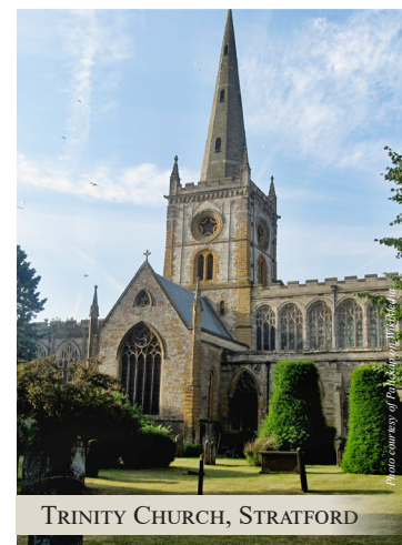
TRINITY CHURCH, STRATFORD

WEDNESDAY, AUGUST 23 RD - Morning transfer to Heathrow Airport for returning afternoon flights to the US (return flights should not be booked departing before 1:00 pm). (B) OVERNIGHT: HOME