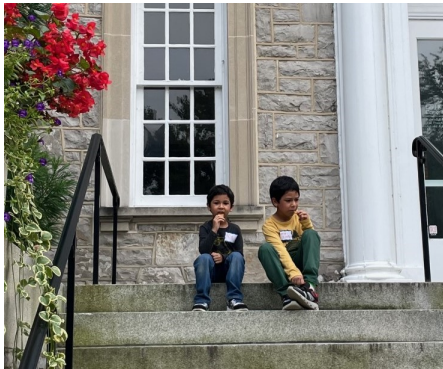
On Weiss Patio (above) for our first LALC Café of the year!