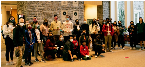
Above and right: our Day of the Dead celebration in the library was a highlight of the fall semester!