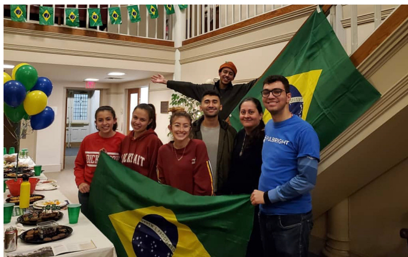
pictured: CGSE São Paulo Program Launch