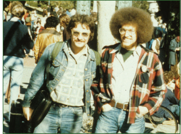
Photo Below: The Heiman Look Alike Contest (Can you name the Alumni in the photo?)