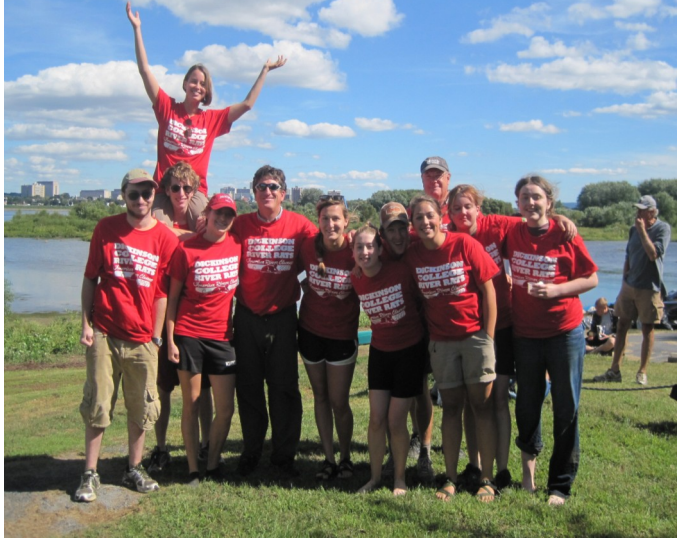
Mosaic students on the Susquehanna clean-up with the local chapter of the Sierra Club.

The students worked with our local Audubon Society to help clean up the trash-strewn islands of the Susquehanna River. They met and interviewed numerous "water-dwelling" residents of Tangier Island, a tiny, yet remarkable landmass in the middle of the Chesapeake Bay. Students were even able