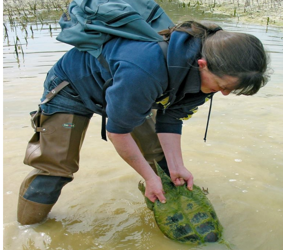
The Mosaic class caught three large snapping turtles during its project to protect the painted turtle from the slider.

to meet the mayor of Tangier, who came to dinner with us and brought the delicious soft-shell crabs we consumed. Our students worked closely with researchers and scientists to prepare specimens that were donated to the State Museum of Pennsylvania in Harrisburg. These individual specimens—insects, amphibians, reptiles, and small mammals—have become part of the permanent natural and scientific record of our state, identified with the individual student's name and appropriate data. During one of the many other field trips the students participated in during the semester they observed the largest herd of elk east of the Mississippi under the guidance of seasoned